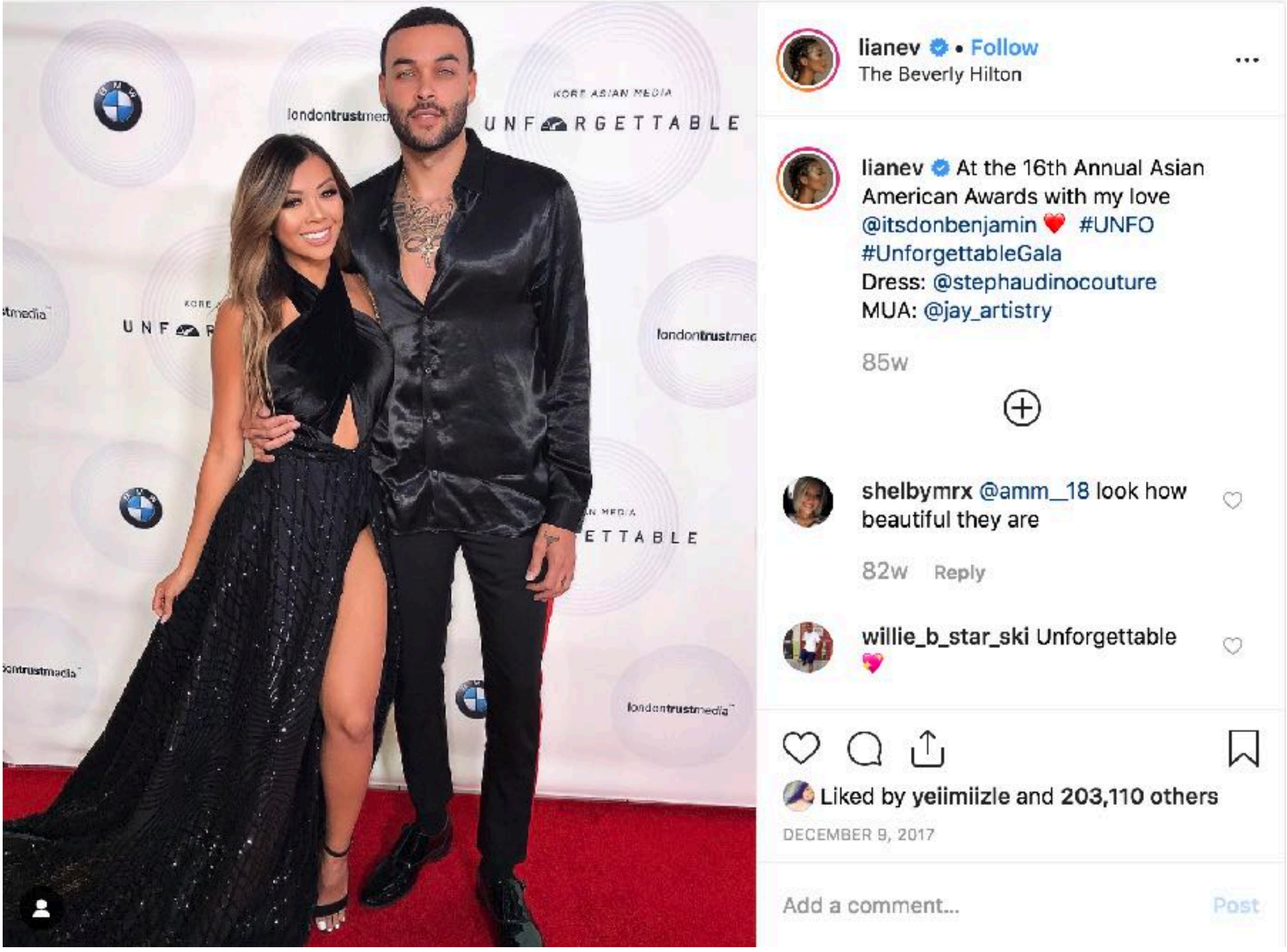
Liane V 4.4m followers 203k 469