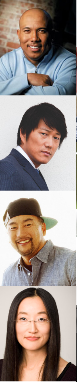
Hines Ward Sung Kang Roy Choi Jennifer Yuh Nelson 2011