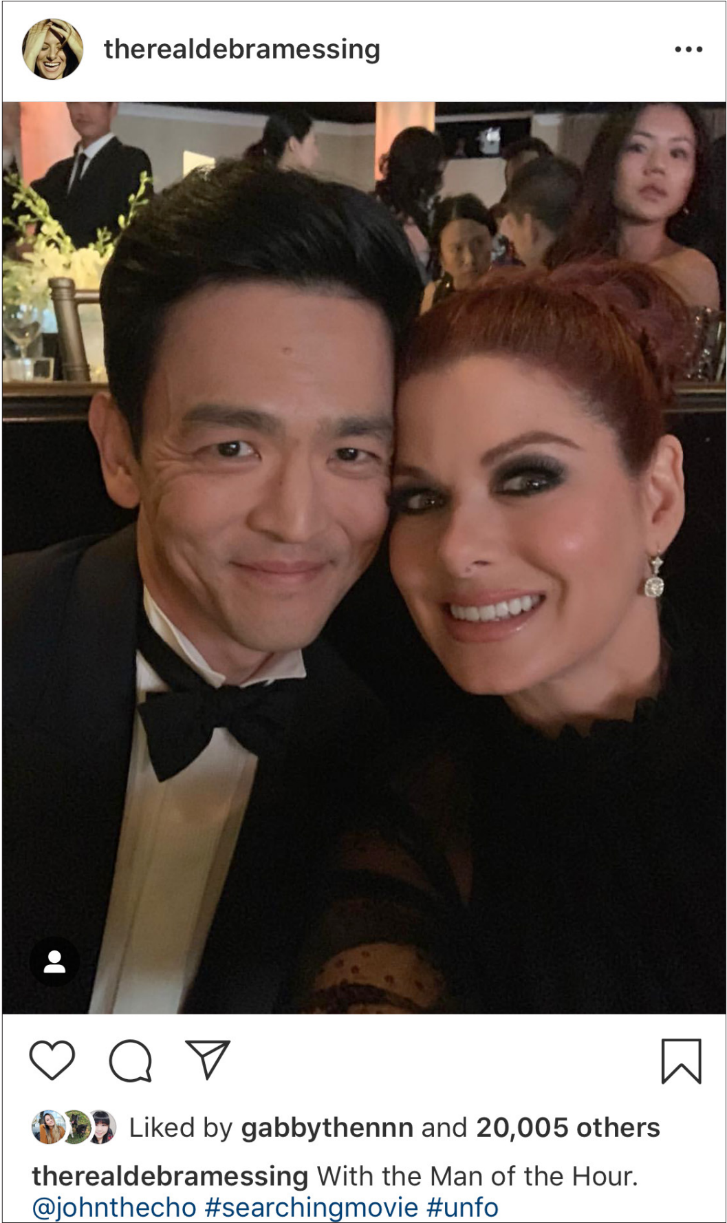
Debra Messing 1.2m followers 20.2k 177