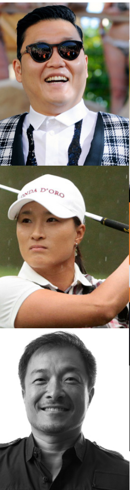
PSY Se Ri Pak Jim Lee 2012