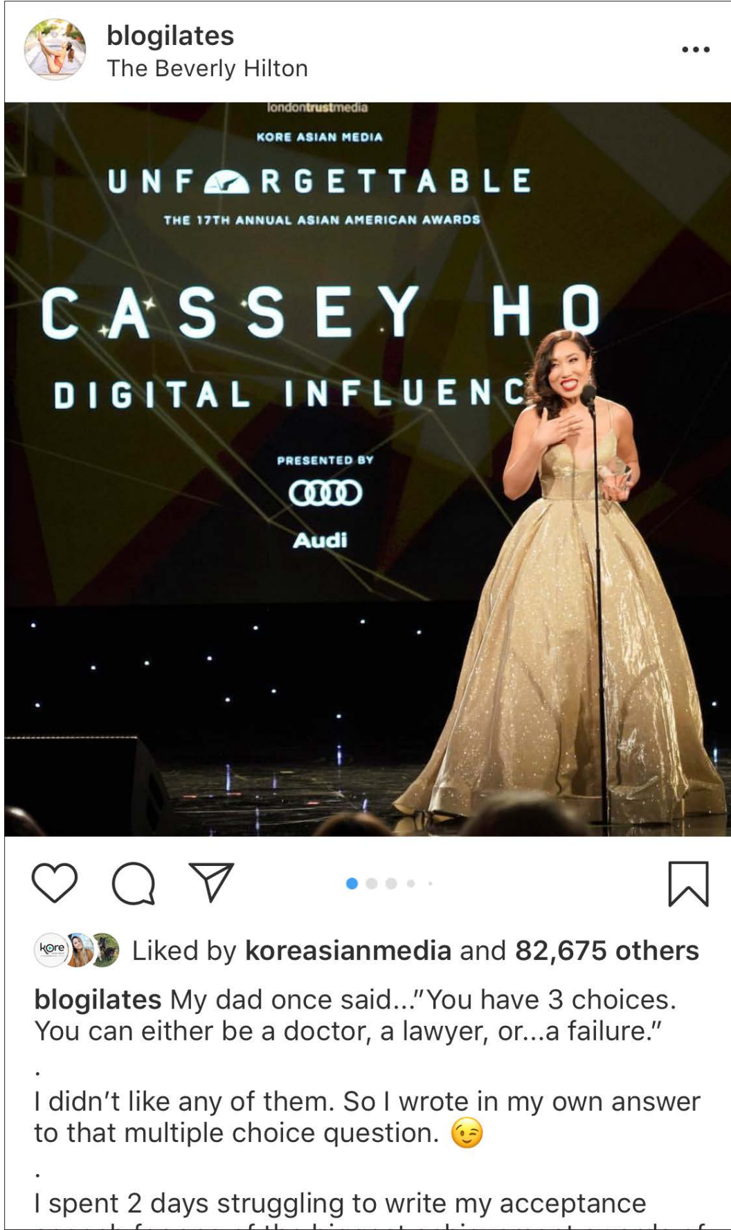
Cassey Ho 1.5m followers 84k 925