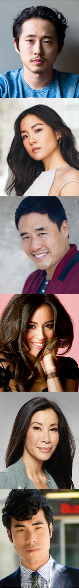
Steven Yeun Constance Wu Randall Park Chloe Bennet Lisa Ling Eugene Lee Yang 2015