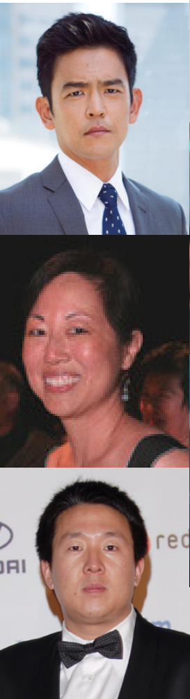
John Cho Jeannie Park Roy Lee 2008