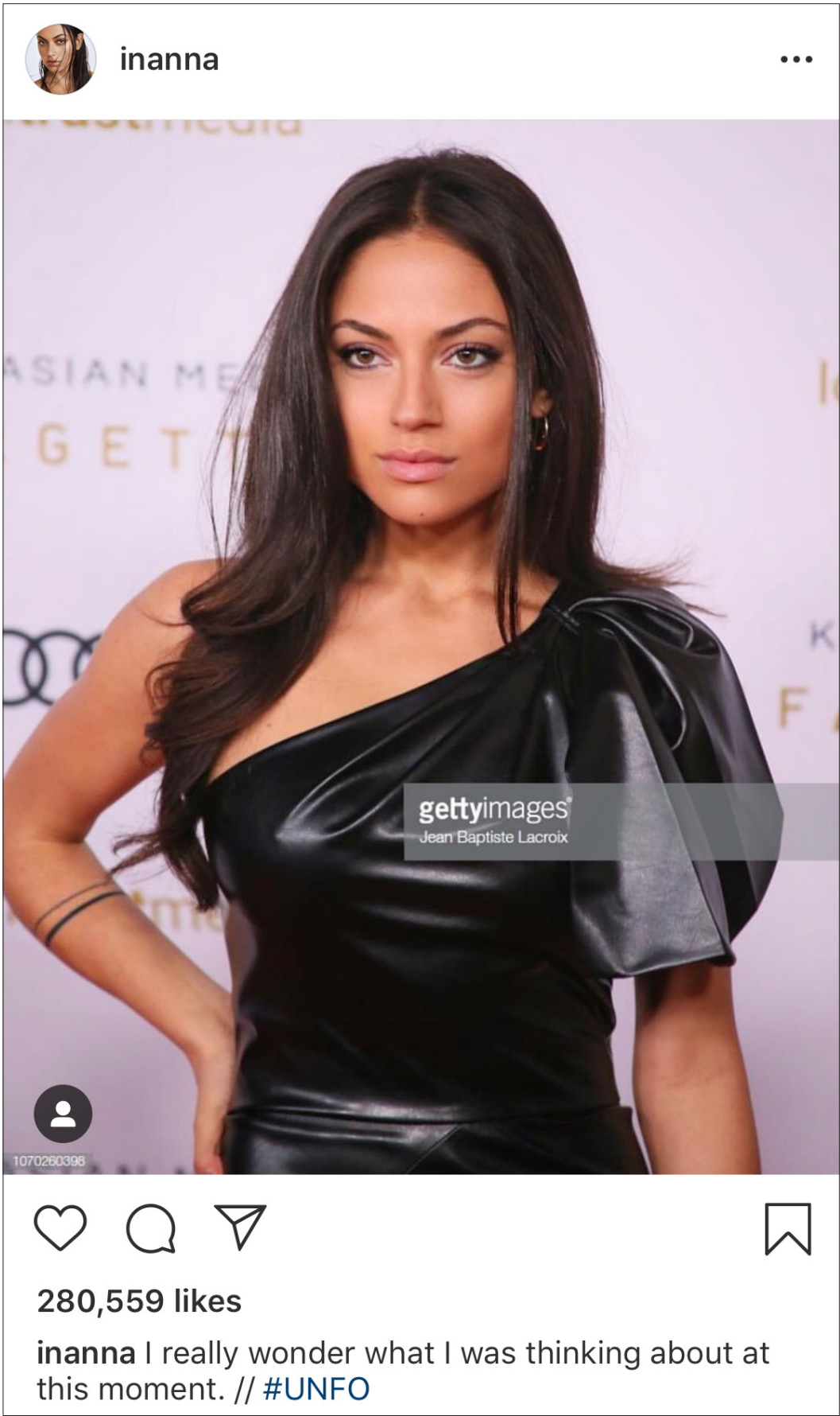
Inanna 9.7m followers 280k 1.2k