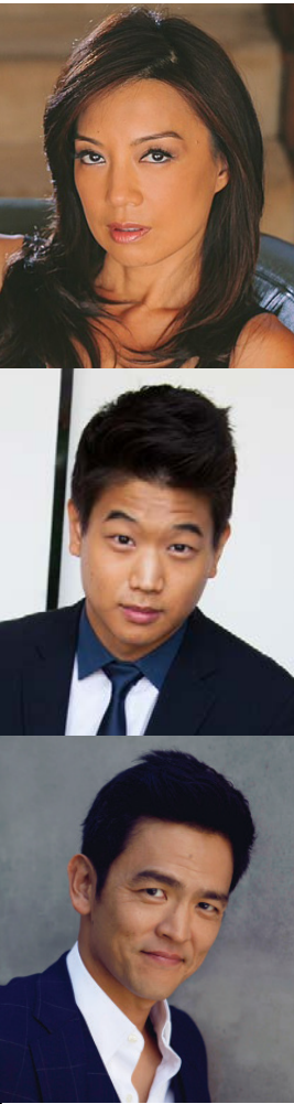
Ming-Na Wen Ki Hong Lee John Cho 2014