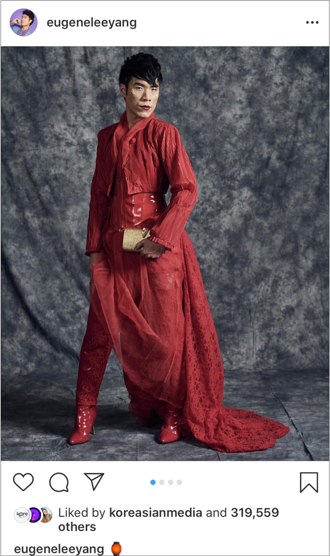
Eugene Lee Yang 2m followers 343k 3.6k