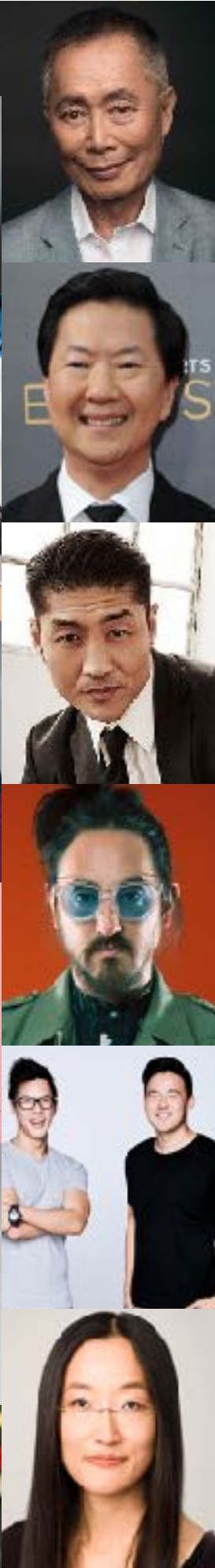
George Takei Ken Jeong Brian Tee Steve Aoki Wong Fu Productions Jennifer Yuh Nelson 2016