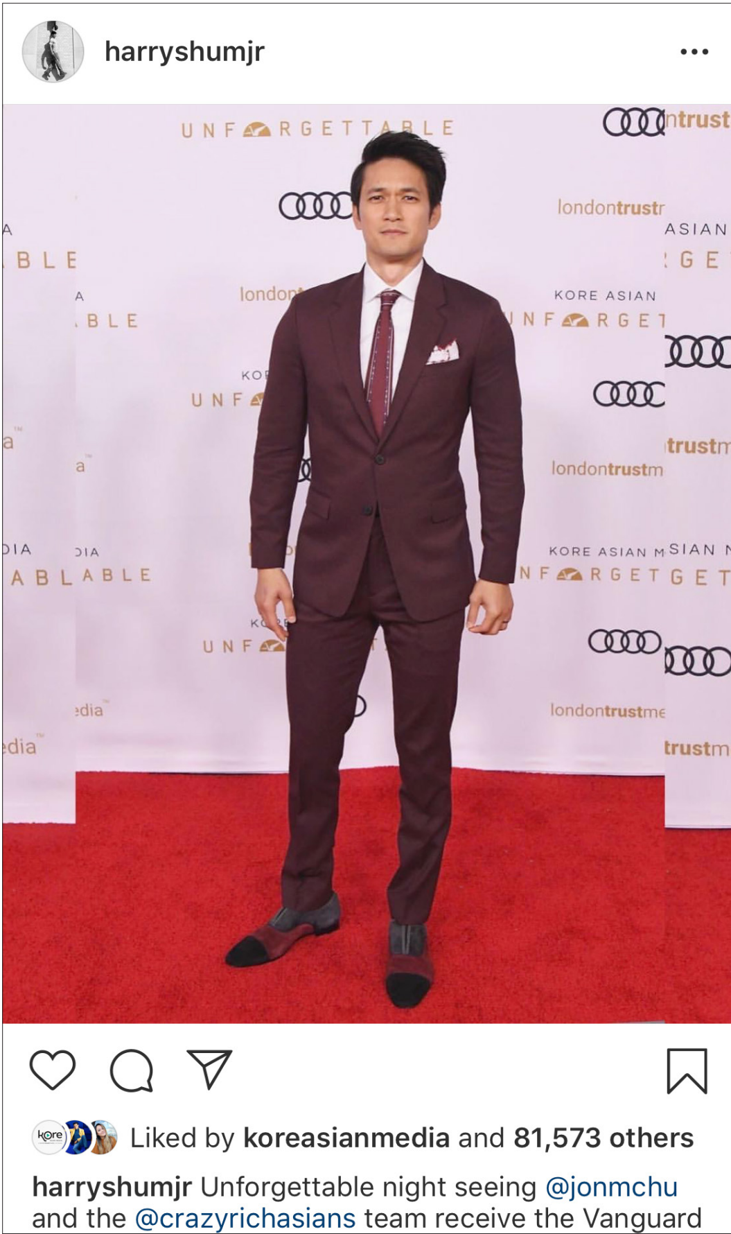
Harry Shum Jr. 2.2m followers 86k 336